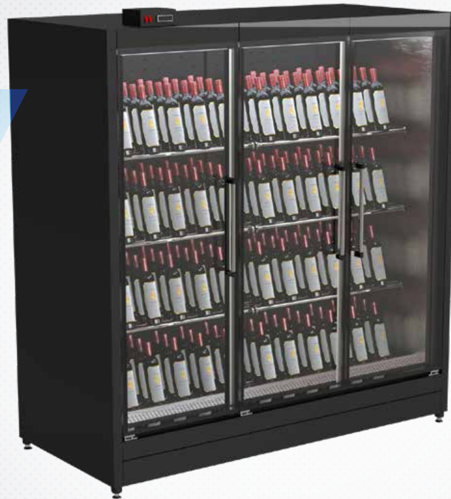
SKY WINE 74 P&P

SKY WINE is available in Remote and Plug&Play version.